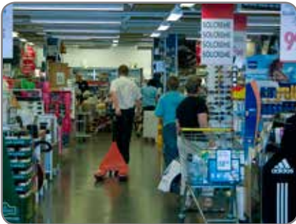
Panther Silent in a supermarket, where comfort and well-being of the customer are vital.