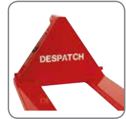
The company name or logo can be cut out in the A-frame of the Panther Silent.