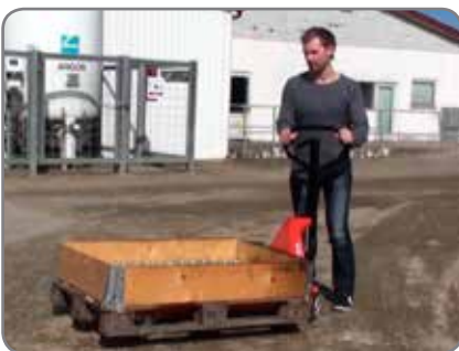
Panther Silent also manages outdoor transport. Metallic chips, small stones and snow do not get stuck to the wheels.