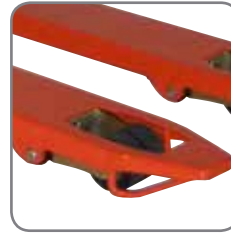
The hoop skates on the forks ensure an easy fork insertion and withdrawal in/out of pallets.