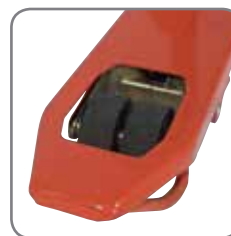
With twin fork wheels it is very easy to change direction.