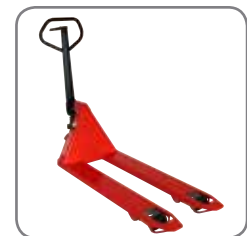
Panther Silent has permanent quick lift.