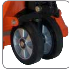
The special rubber wheels are gentle to floor and flagstone layer and do also have eminent anti-static qualities.