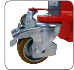
Parking brake on LogiQ 660.