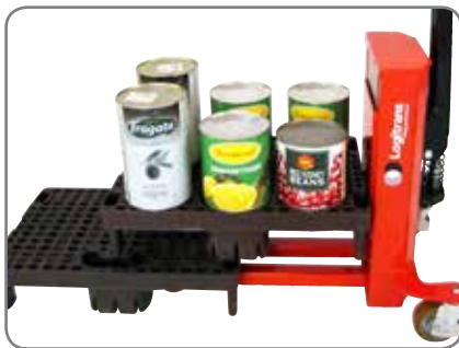
LogiQ 660 can handle the upper quarter pallet without problems.