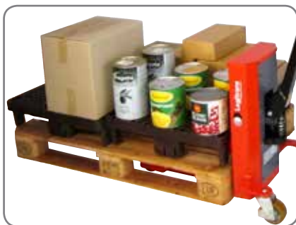
A quarter pallet is lifted from a EUR pallet with LogiQ 660 and can be moved to the location of display in the shop.