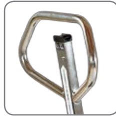
The ergonomically correct handle ensures the user a relaxed hold.

Strong construction ensures a long operating life and low maintenance costs.