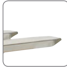
Closed forks mean easy cleaning and few hiding places for bacteria.