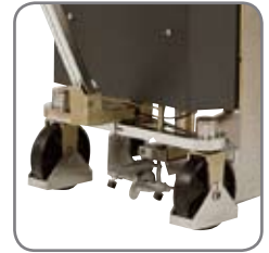
TS-E STAINLESS-SEMI has assisted wheel steering. Easy and hygienic operations.

Available with manual or electric lifting.