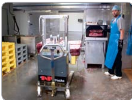
STAINLESS-SEMI - for the food industry and other environments with strict hygiene demands.